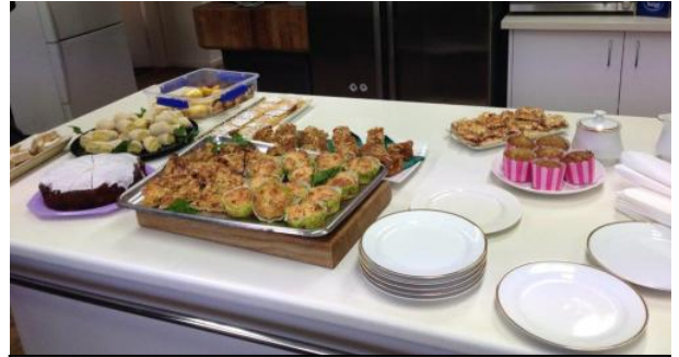
Morning tea prepared by the Stitch & Share ladies.