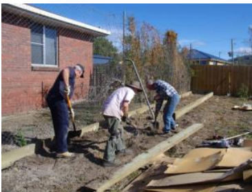
Above: Willing workers preparing the ground just prior to installation of the treated sleepers