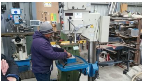
A member receiving tuition in the use of the geared drill, which was also purchased through a grant from the DPAC in conjunction with TMSA

A final note of thanks goes to Gary Durrant, who not only organised the training programme, but will conduct a member survey later in August to find out what participants thought of the skills programme, whether the sessions meet their needs and more importantly, how we can improve the next programme.