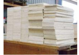
Stacked sections of parrot transport boxes