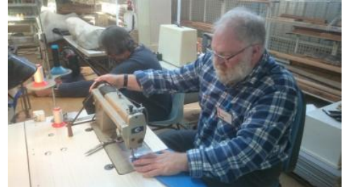
The ladies of the Stitch & Share Group might have some competition using sewing machines by the looks of things.

In all 32 members and several Shed visitors completed 62 days of training – a great turn out for a volunteer, not for profit organisation.